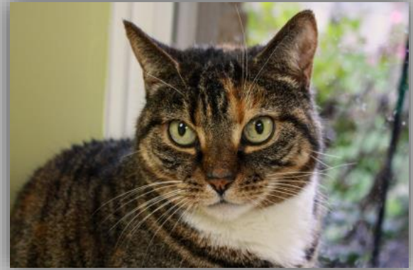
Our girl Antigua! Please refer an adopter!